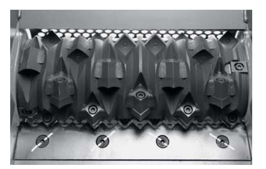
ROTOR > The innovative V rotor with SuperCut cutting gap adjustment guarantees optimal cutting geometry. The result: Homogenously shredded material, high throughput, low wear and energy consumption, resistance to foreign material.